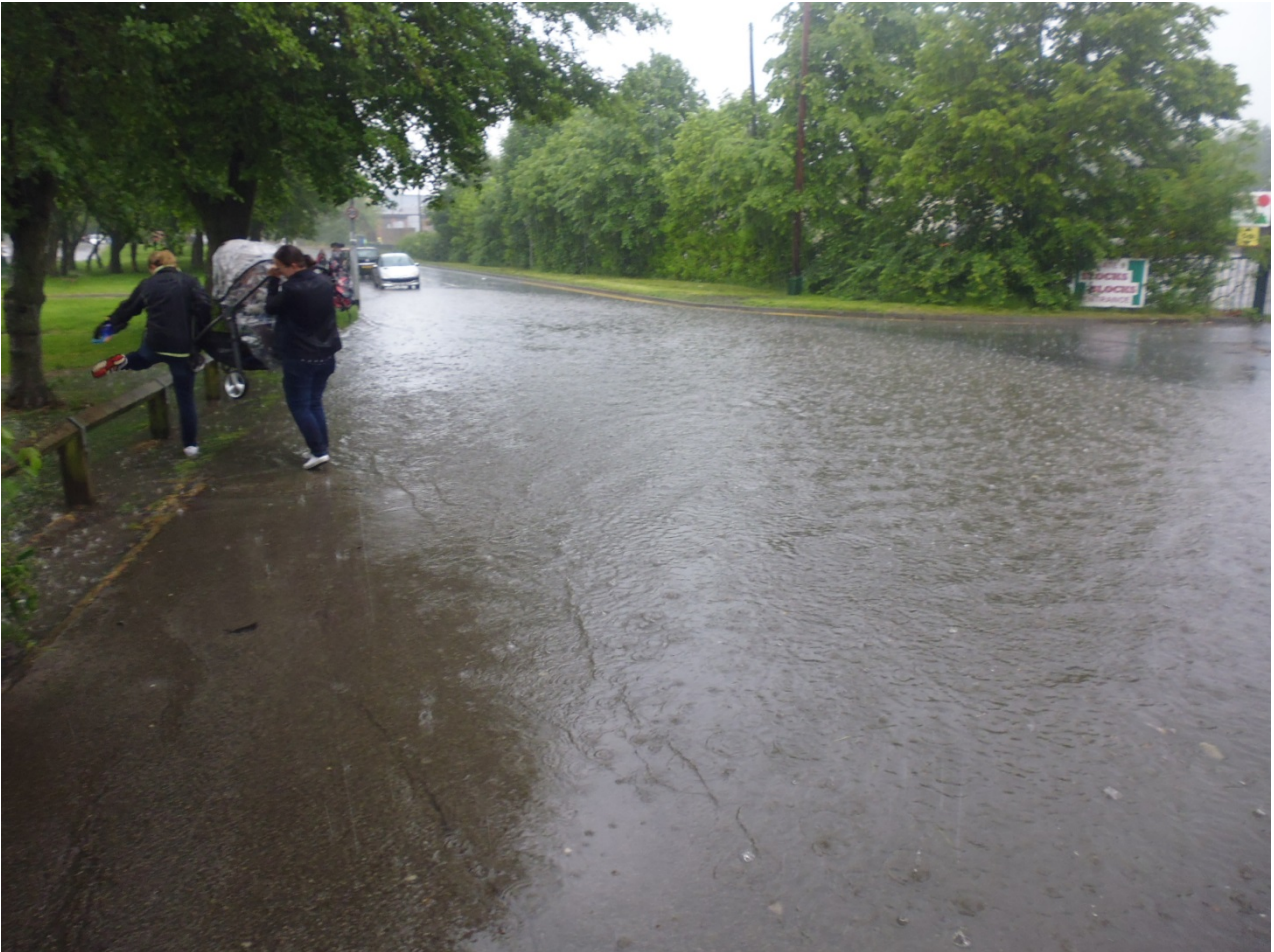
Figure 1 – Flooding at Ninelands Lane June 2016